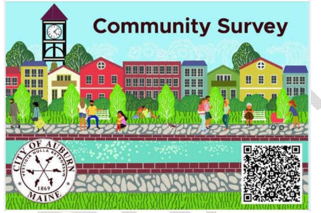
Community Survey SM Posting